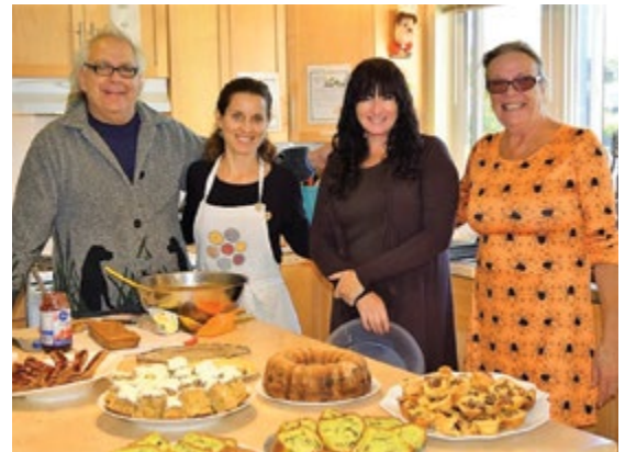
► Staff and members of the Clubhouse in the Kitchen.